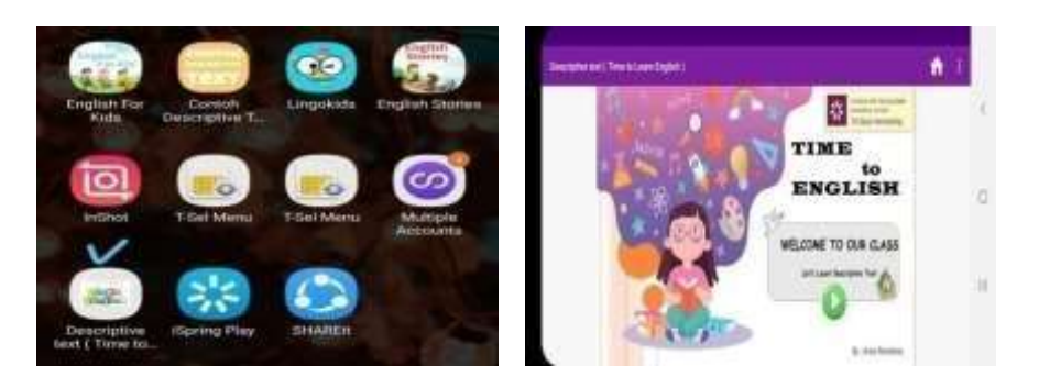
Picrure 2.14. Final project

the results can be seen in the image below: